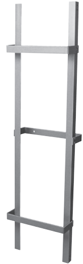
Lattice Track 012-5049R